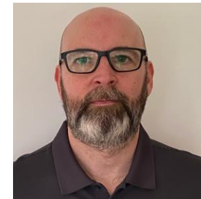
Appointed Business Advisor (Northamptonshi re Specialist)